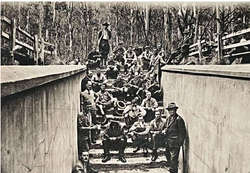
The Melbourne Walking Club at Bullarto Mineral Springs, Western District (date unknown)

If undeliverable, return to: Melbourne Walking Club Inc.