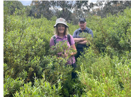
This is why the Boobyalla Track needs clearing

Walk Details: From the bus stop on Elgar Rd. we walk to the Wattle Park chalet picnic area for morning tea. The only toilets on the walk are at this location. The walk then explores the park, nearby Gardiners Creek and parts of the Deakin University grounds. Lunch will again be at the picnic ground adjacent to the chalet. There are some short uphill sections.