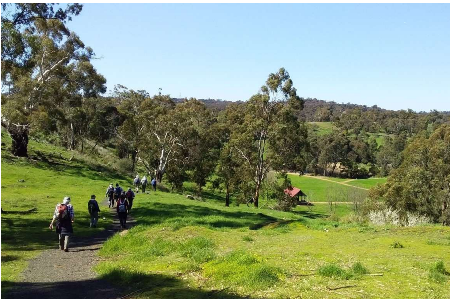
Hawkstowe Picnic Area approach, November 2019

If undeliverable, return to: Melbourne Walking Club Inc.