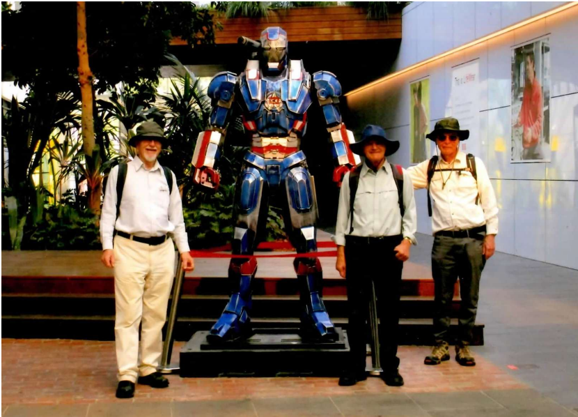
Now that's a power walker!

If undeliverable, return to: Melbourne Walking Club Inc.