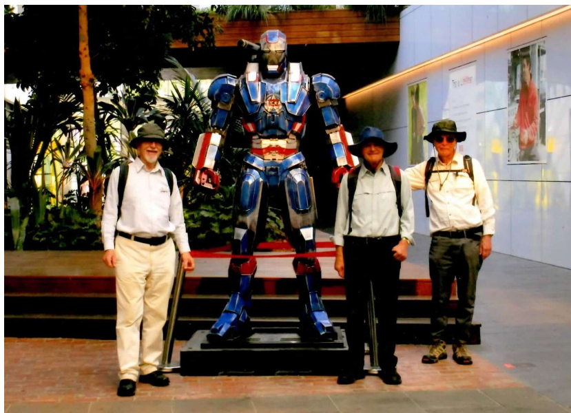
Now that's a power walker!

If undeliverable, return to: Melbourne Walking Club Inc.